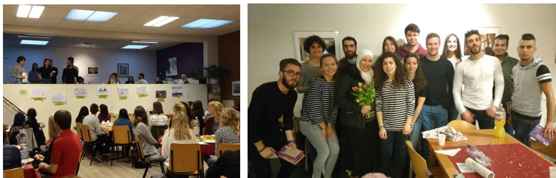
First picture: The team of Amnesty International and Colours of a Journey address the audience. Second picture: some members of the organisers teams and the Syrian refugees who participated on the dinner.

mentioned nomadic exhibition. For this, we exhibited some of the Colors of a Journey paintings on the walls during a dinner which aimed to raise awareness about the situation of refugees. The “Syrian dinner”, was largely organised by Syrian refugees themselves, who not only provided the catering, but who also participated in giving speeches, and engaging with all the attendees. They shared their own opinions and experiences, and expressed as their perceptions of the drawings we exhibited, as did the guests.