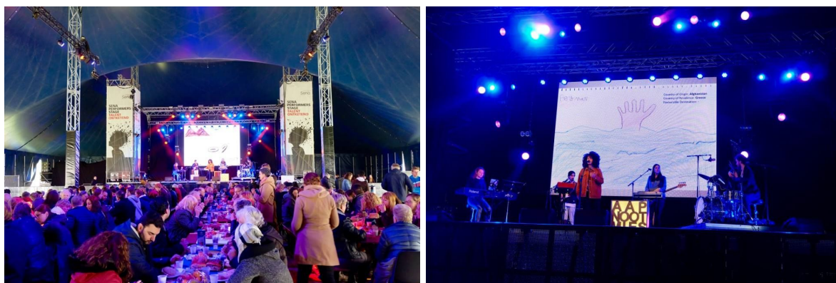
The band Aapnootmies gave a passionate concert that empowered the meanings of the drawings, while the public discussed with the CoJ members about the issue

On the 5th of May 2017, Colours of a Journey had the opportunity to participate in the Liberation Day Festival in Groningen, which celebrates freedom from war and oppression, and reflects upon freedom elsewhere in the world. This theme corresponds well with the Colors of a Journey project, and so the festival was the perfect occasion to display the drawings. The artworks were displayed during the concert of a Syrian Choir (New Life Groningen Choir) and a Dutch band (Aapnootmies). With an audience of more than 300 people, the drawings were projected digitally onto a large screen behind one of the festival stages, while members of our project interacted with guests on the different tables, explaining the project and discussing the solidarity crisis.